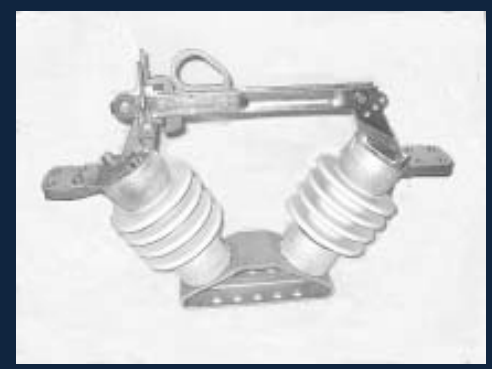
Hookstick switches are available in several different "V" configurations up to 2000 amps and up to 145 kV.