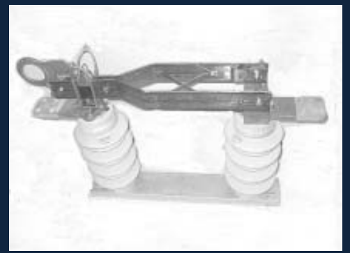
Hookstick switches available in ratings from 600 to 6000 amps, depending on voltage. Voltage ratings up to 169kV